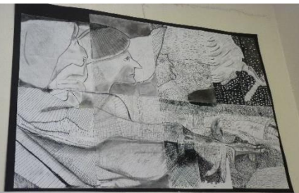
The Three Witches - Macbeth

See what all our classes have been getting up to by going to the school website & 'Life in School'.