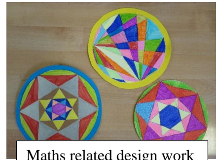
Maths related design work